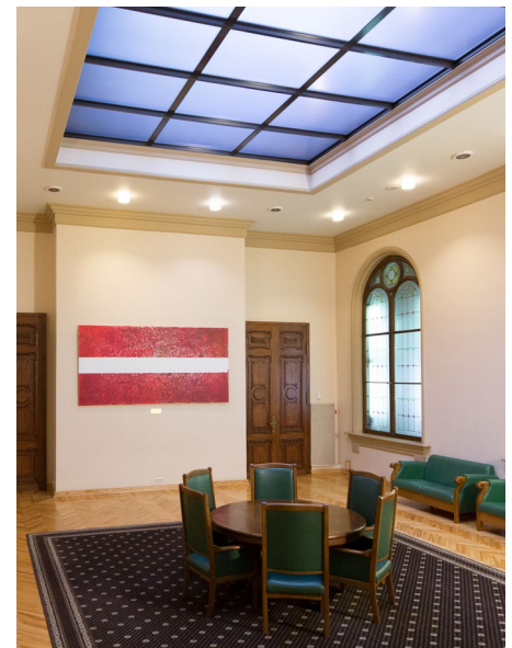
■ Voting Room

The magnificent Plenary Chamber is the most significant room in the main building of the Saeima. This is where MPs gather for sittings to debate and adopt laws. The Chamber is divided into two parts—seating for the MPs and a visitors' gallery. The MPs' area acquired its current semi-circular shape of an amphitheatre only in 1998. The Plenary Chamber comprises seats for one hundred MPs, as well as special seats for the President of Latvia, the Prime Minister, ministers, and the Presidium of the Saeima. Dark brown panels cover the walls. Next to the Presidium seats, there are two flags: the flag of Latvia and the flag of the European Union, and on the wall above, there is an oak-carved coat of arms of the Republic of Latvia, restored according to photographs. In addition, the Chamber contains plaques with