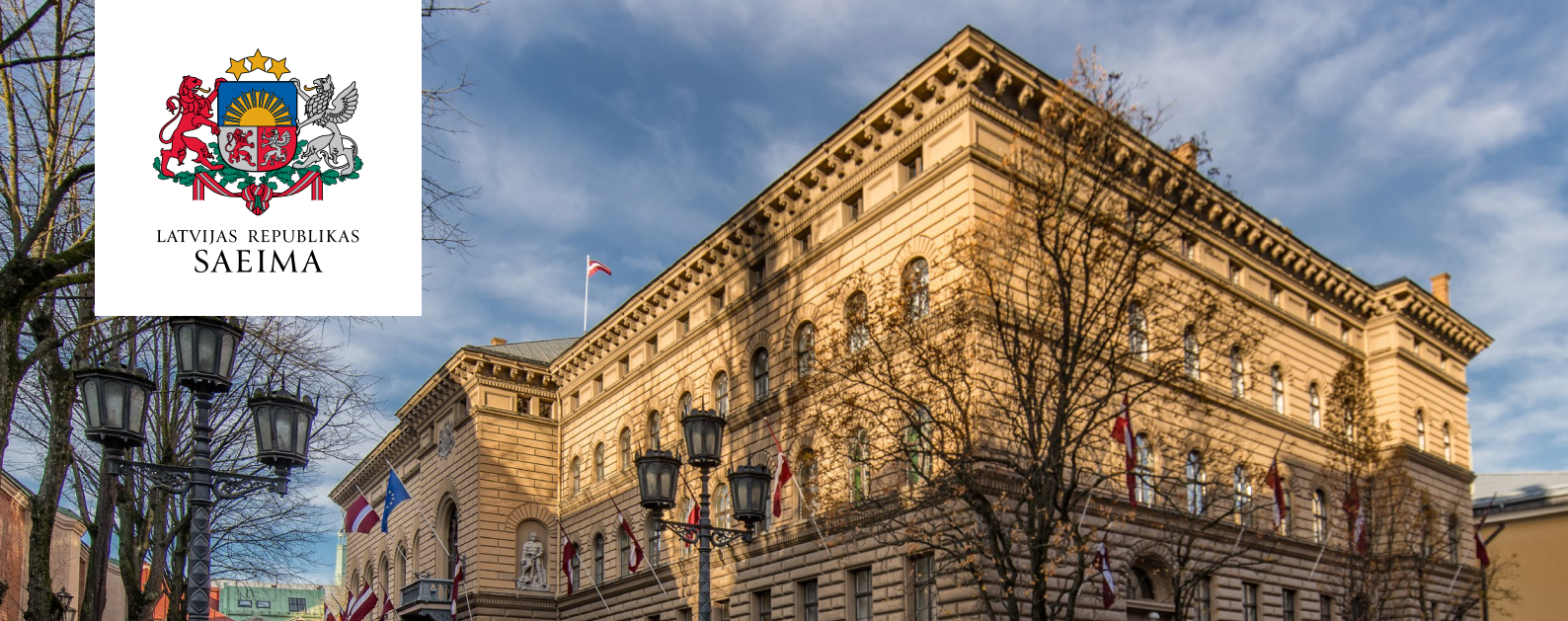
■ Main building of the Saeima